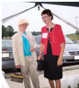
A pair of Ms. Relays!